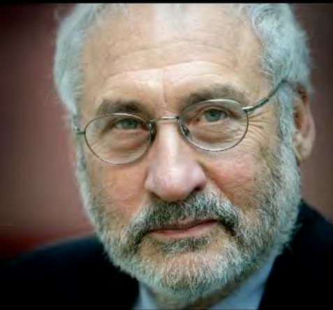
Joseph Stiglitz, Nobel Prize 2001